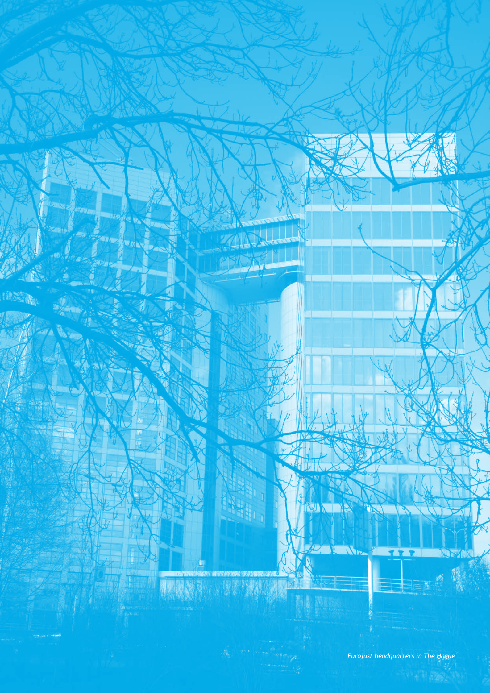
Eurojust headquarters in The Hague