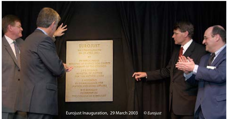
Eurojust Inauguration, 29 March 2003

Beyond this, there are decisions about the future of Eurojust which involve major political considerations. The obvious example is the possible creation of the European Public Prosecutor's Office 'from Eurojust', in the words of the Treaty of Lisbon. What Eurojust can contribute to the debate is an evidence-based approach, attempting to draw lessons from its casework. Whatever decision is ultimately taken, Eurojust will continue to work to make Europe a safer and more just place for its citizens by helping in the fight against serious cross-border crime." ■