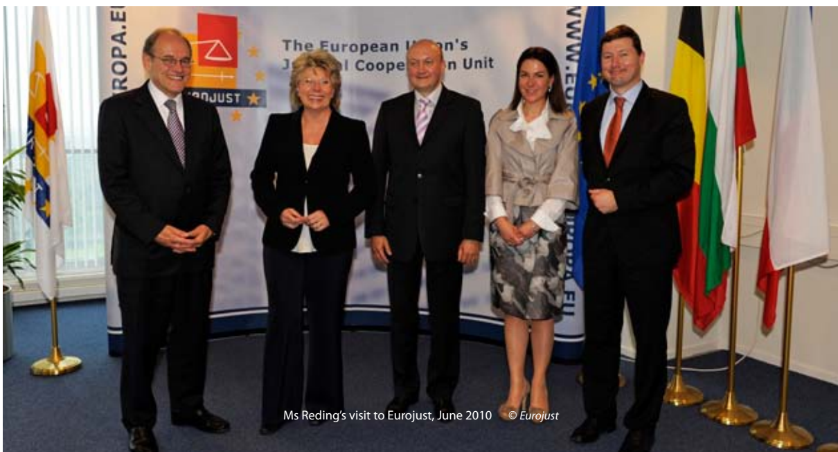
Ms Reding's visit to Eurojust, June 2010

Without the coordinating efforts of Eurojust and without its expertise, national judicial authorities would not have the necessary information needed to take informed decisions on the prosecution of criminals. They would not be able to act as effectively as they do today.