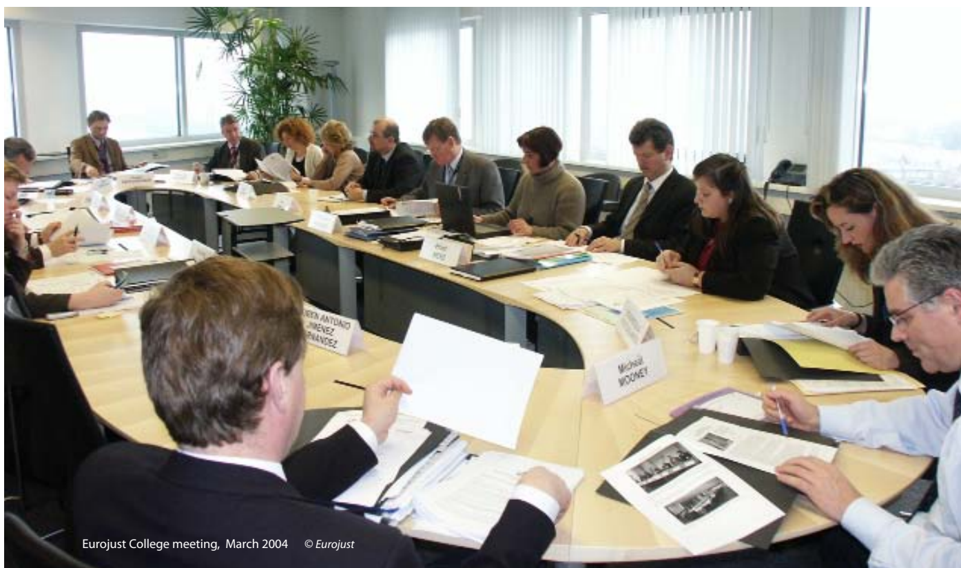
Eurojust College meeting, March 2004

Other keys to our success were the strength and level of experience in the College and the administration and the good relationship we maintained with our administrative staff."