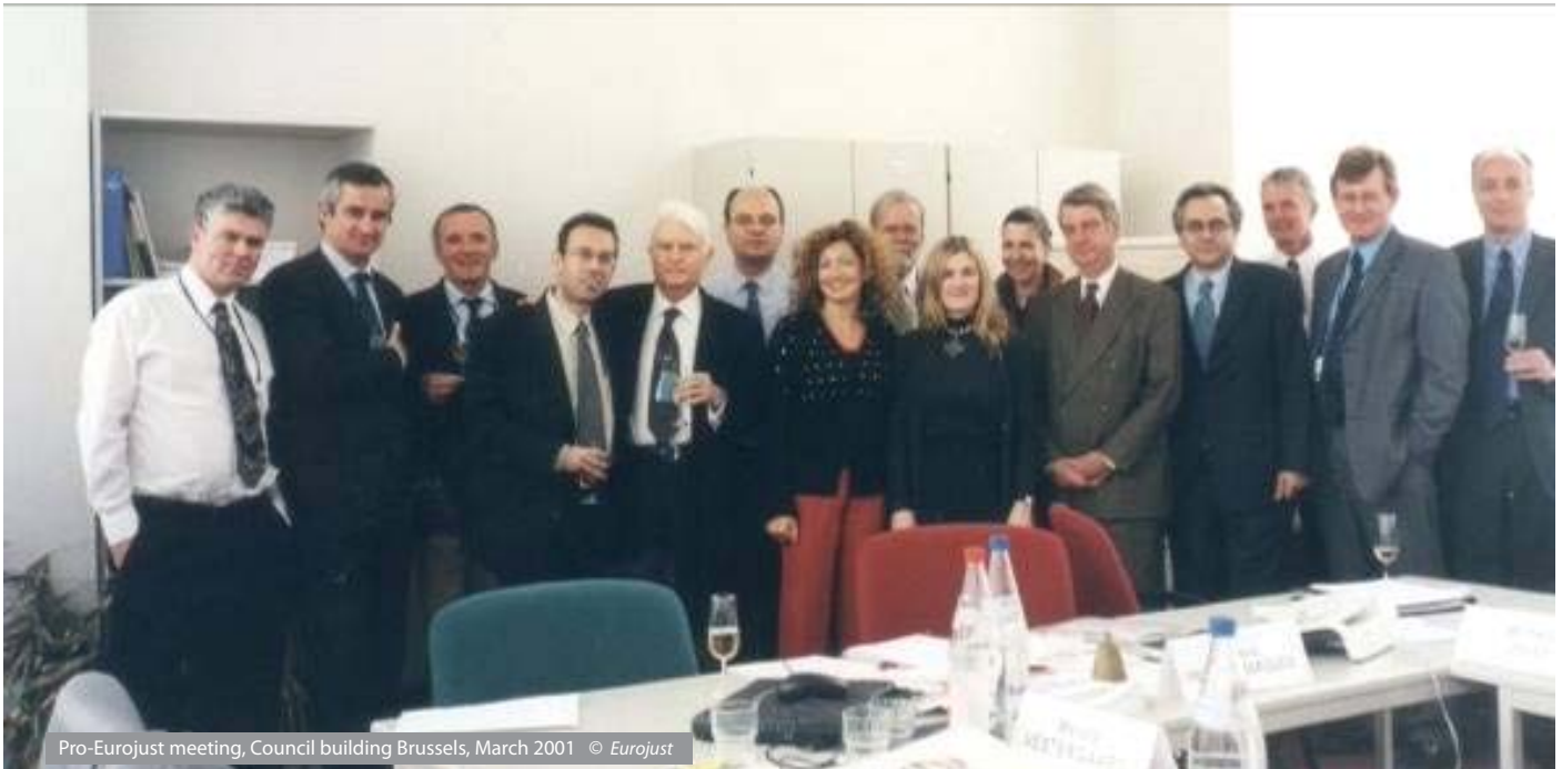
Pro-Eurojust meeting, Council building Brussels, March 2001

With the attacks of 9/11 in the USA, the focus on the fight against terrorism moved from the regional/national sphere to its widest international context and served as a catalyst for the formalisation, by Council Decision 2002/187/JHA, of the establishment of Eurojust as a judicial coordination unit. In the first half of 2002, during the Spanish Presidency of the EU, important milestones were reached: the Eurojust Decision was published on 28 February, the budget was released in May, and the Rules of Procedure were agreed upon in June.