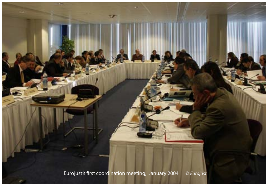
Eurojust's first coordination meeting, January 2004

load dealt with by Eurojust has increased sevenfold since its beginnings (2002). How would you explain this phenomenon? Is this a measure of Eurojust being better known Europe- and/or worldwide? "There are many possible explanations. I would like to think that Eurojust is becoming better known because it offers a useful service to Member State practitioners, so that case referrals increase accordingly. At the same time, the population of the European Union has increased to approximately 500 million by successive enlargements and demographic change over the last ten years. This would account for some increase in the number of cases referred to Eurojust.