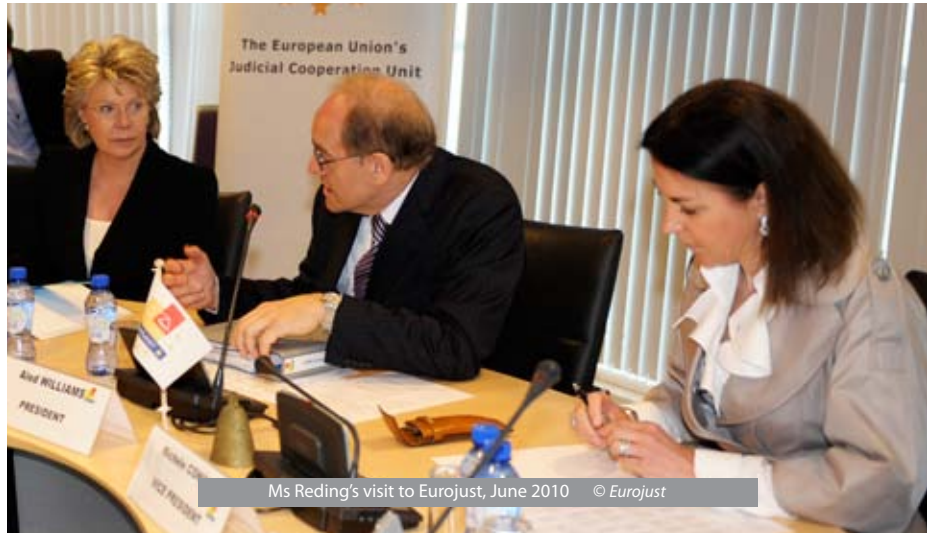
Ms Reding's visit to Eurojust, June 2010

"One of the most important novelties offered by the Lisbon Treaty in the area of judicial cooperation is the establishment of a European Public Prosecutor's Office based at Eurojust. Its investigations would cover crimes against the EU's financial interests. The European Commission is eager to ensure that crimes affecting the financial interests of the European Union are pursued and criminals prosecuted. Fraud against the EU budget is fraud against taxpayers' money. In today's economic times, every cent matters. A European Public Prosecutor's Office would be an important instrument to meet this objective and close the legal loopholes that allow fraudsters to go unpunished. The Commission is examining how Article 86 can best be used for such an initiative." ■