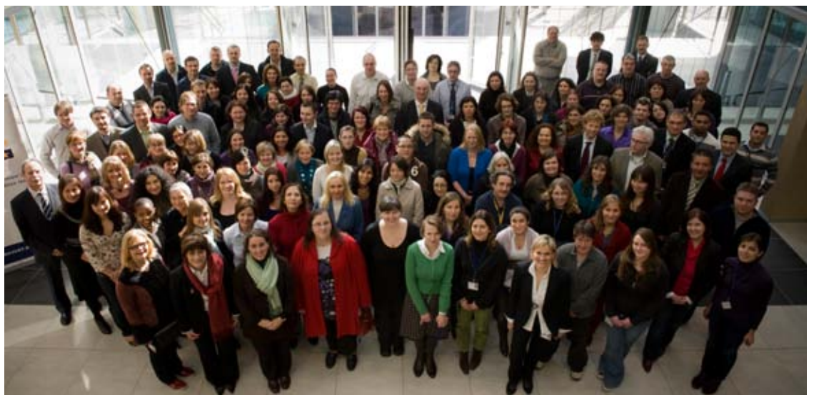
Eurojust administrative staff, 2004, 2006, 2008, 2011.