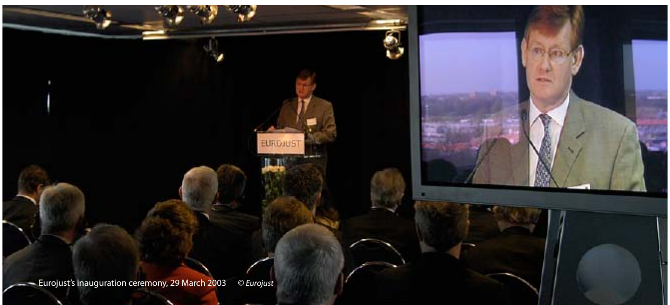
Eurojust's inauguration ceremony, 29 March 2003