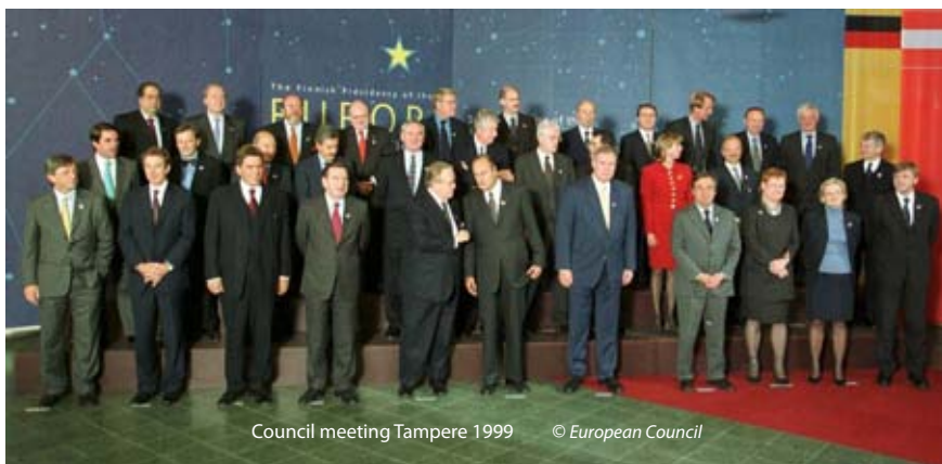
Council meeting Tampere 1999