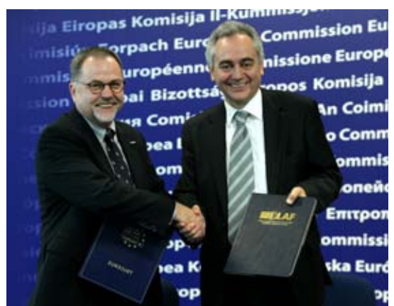
Cooperation agreements (left) Europol, 2004; Switzerland, 2008; Norway, 2005; Iceland and Romania, 2005; (right) USA, 2006; FYROM, 2008; Croatia, 2007; OLAF, 2008.