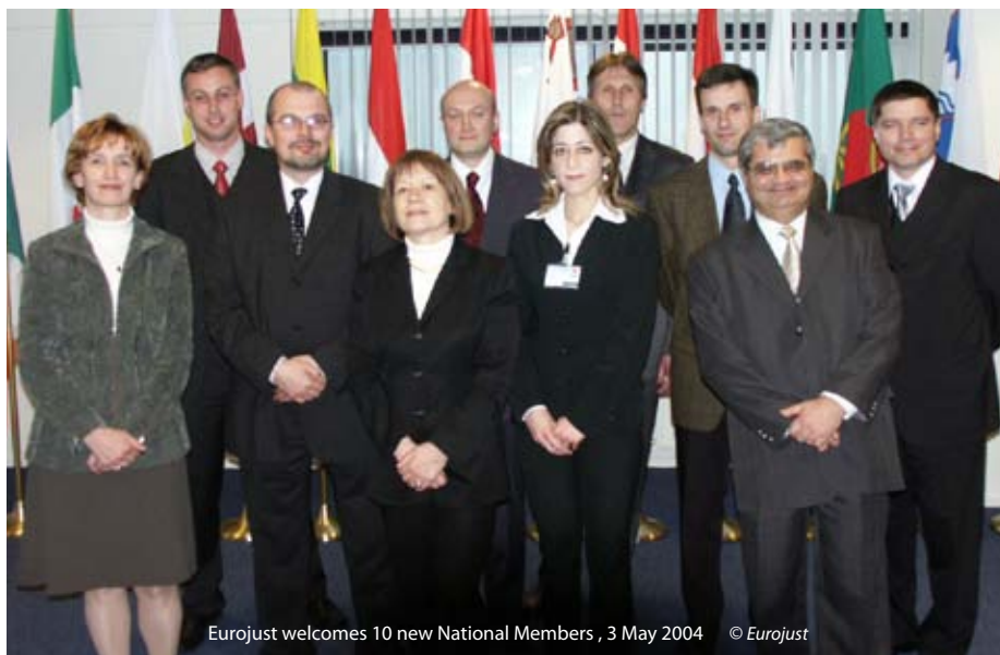
Eurojust welcomes 10 new National Members, 3 May 2004

“Preparing for the inclusion of 10 new Member States posed logistical challenges. We had to ensure good working conditions for the influx of people, without interrupting our core business: the casework. We organised the distribution of offices in such a way that the new National Members were located next to their geographic neighbours. Completion of our conference facilities in 2004 made a tremendous difference. Based on our experiences in 2004, preparation for the accession of Ro-