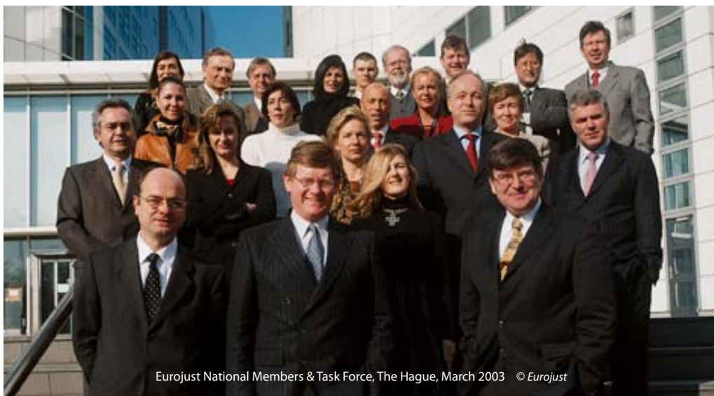
Eurojust National Members & Task Force, The Hague, March 2003

Pro-Eurojust formally started work on 1 March 2001 under the Swedish Presidency of the European Union.