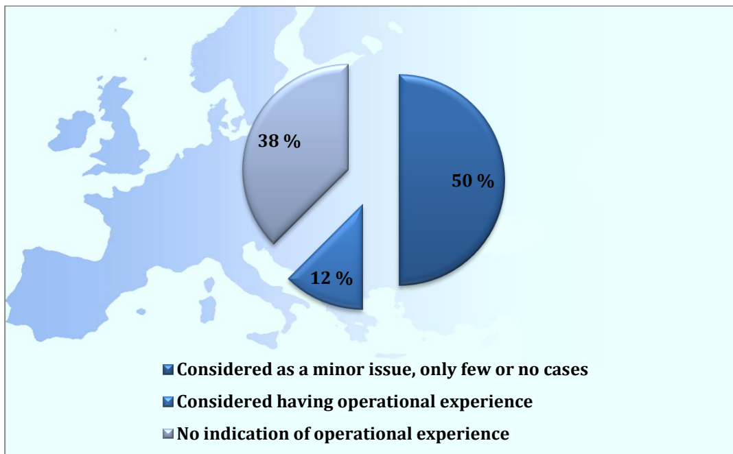
Chart 1: Operational experience of the judicial authorities

One of the most logical and obvious reasons is the lack of regulations stipulating a certain substance as illegal. As a result, these substances do not reach the criminal justice system. One respondent explicitly pointed out that the perpetrators keep an eye on current legislation and adapt their products accordingly. Also, few responses related to the exploitation of legal gaps by the perpetrators. One State explicitly noted that missing legislation had attracted the criminal activities to this State from a neighbouring State. Similarly, when a prohibition on possession, manufacturing, buying, selling, importing and/or exporting a certain substance is stipulated as an administrative offence only or by penalties from the low end of the range, these cases are not likely candidates for international legal cooperation.