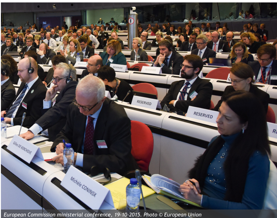
European Commission ministerial conference, 19-10-2015.

De-radicalisation, disengagement and rehabilitation have been identified as EU priorities in the European Agenda on Security of April 2015.