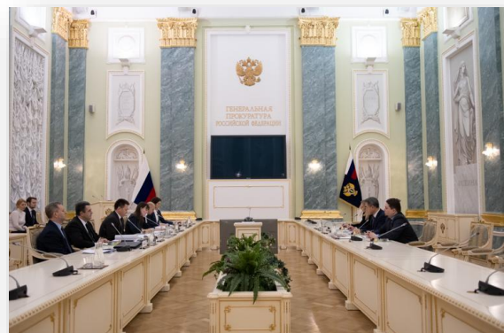
The IAP delegation meeting Russian colleagues