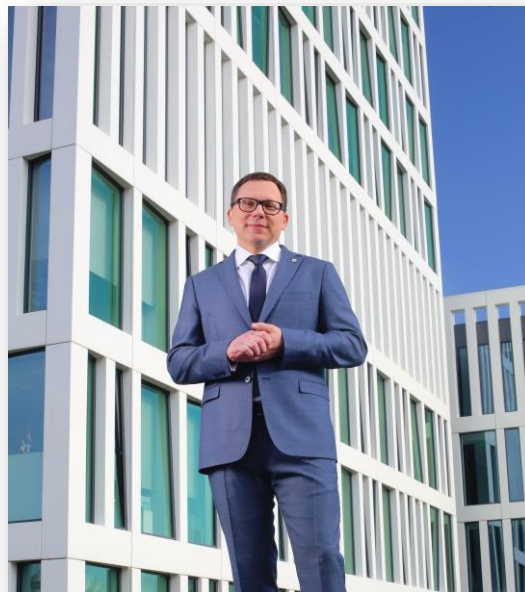
The President outside the Eurojust building

Becoming a prosecutor in this day and age means that you will almost certainly deal with cases of a cross-border nature. As I mentioned earlier, this requires the ability to respect diversity and maintain an open mind. More in general, you have to be prepared for the high pressure that comes with this job. You will face long hours, conflicting interests and disappointment when you realise that justice does not always prevail in the way you thought it would. At the end of the day, what matters most is being able to look in the mirror, knowing that you kept your back straight and did the right thing.