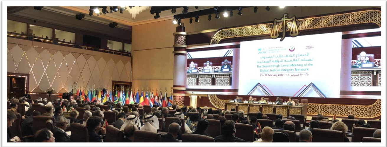
The GJIN meeting in progress in Doha

The Global Judicial Integrity Network is one of the key results of the efforts of the United Nations Office on Drugs and Crime (UNODC) Global Programme for the Implementation of the Doha Declaration, which aims to assist Member States in implementing key areas of the Doha Declaration adopted at the Thirteenth United Nations Congress on Crime Prevention and Criminal Justice in 2015.