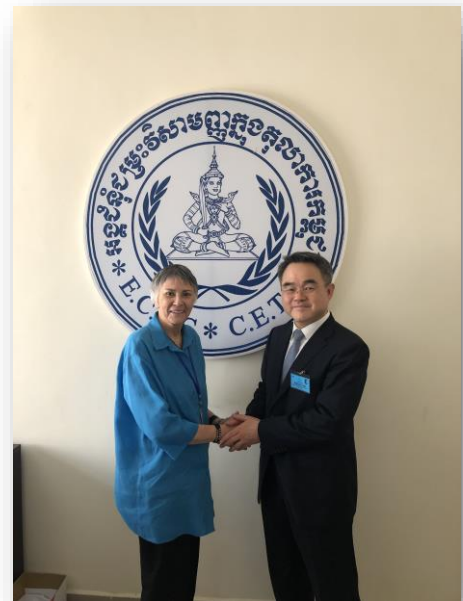
Ms. Brenda J. Hollis meeting IAP President at the ECCC

Prosecutor Hollis welcomed the IAP President's visit and said that she was already familiar with the IAP's activities. She also hoped that the ECCC Prosecution officers would attend a meeting hosted by the IAP in the future. On the same day,